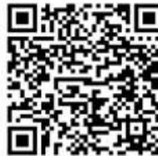
Link to this flyer

SPONSORED BY: DSC EDUCATION & RIFLE COMMITTEES