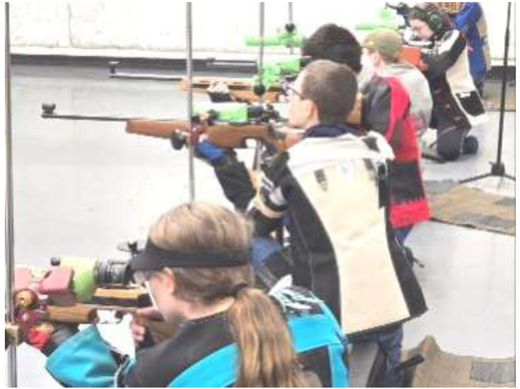
Junior shooters competing in the NRA Jr. Sectional, Feb. 22 & 23, 2025, in the kneeling position. In the DSC basement range.