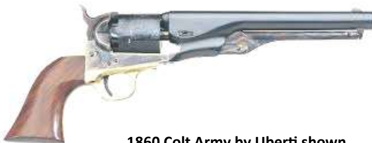
1860 Colt Army by Uberti shown.

Among black powder enthusiasts, there seems to be relatively little interest in C & B revolvers. I suspect that most, if not all, BP enthusiasts own or have owned a C & B revolver. They have probably even fired it a time or two, but generally they are not seen on the range. To my knowledge, there are no local matches or regular shoots for them in the Southeastern Michigan area. Really, the only time you might see one on the black powder ranges is when a regular decides to pull one out from deep in the gun closet just to give it a try. Black powder enthusiasts are overwhelmingly long gun shooters of either the trade gun (i.e. smoothbore) or long rifle persuasion. Continued on page 5.